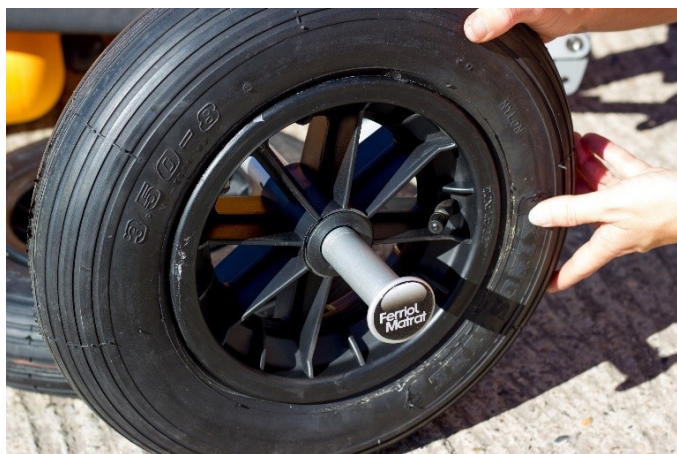
3. Slide the wheels onto their axles, with the valve facing outwards, then replace the axles in their housing.