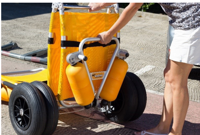
6. Unfold the seat