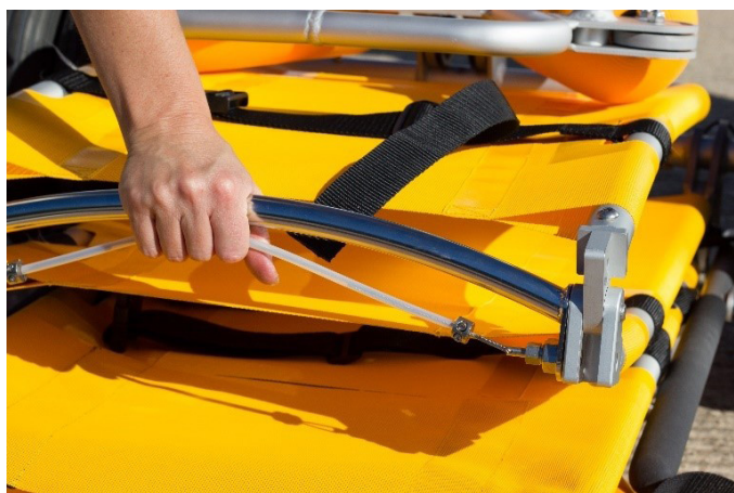
5. Unfold the folder