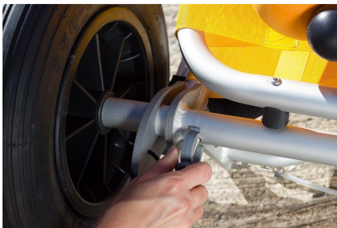
4. Replace the safety pins.