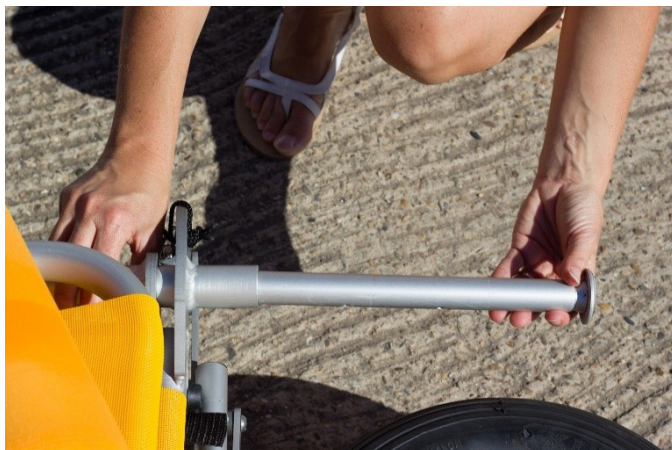
2. Remove the wheel axles.