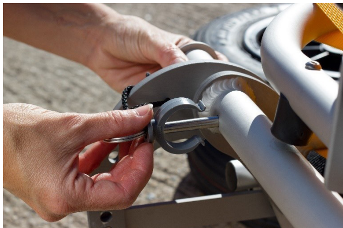
1. Remove the safety pins from the wheel axles.