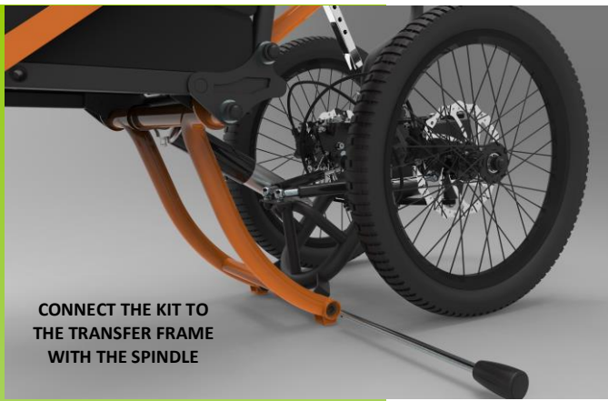
CONNECT THE KIT TO THE TRANSFER FRAME WITH THE SPINDLE