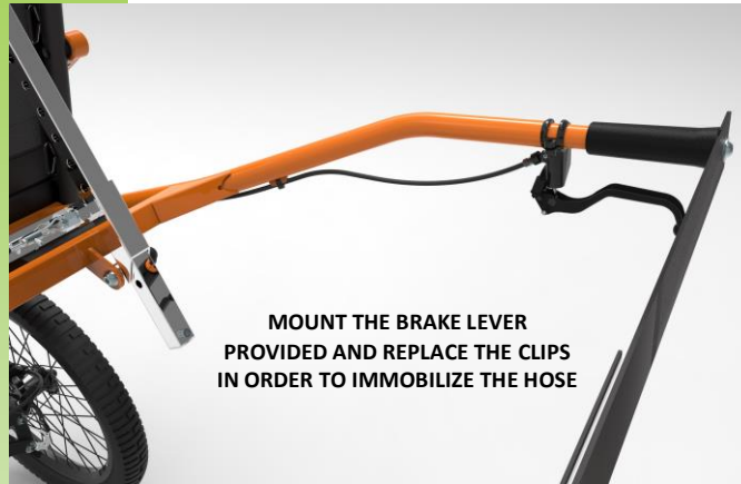
MOUNT THE BRAKE LEVER PROVIDED AND REPLACE THE CLIPS IN ORDER TO IMMOBILIZE THE HOSE